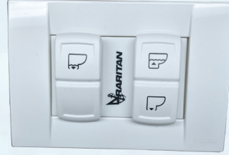
Multifunction Flush Panel