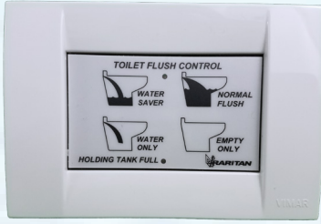
Smart Toilet Control STC